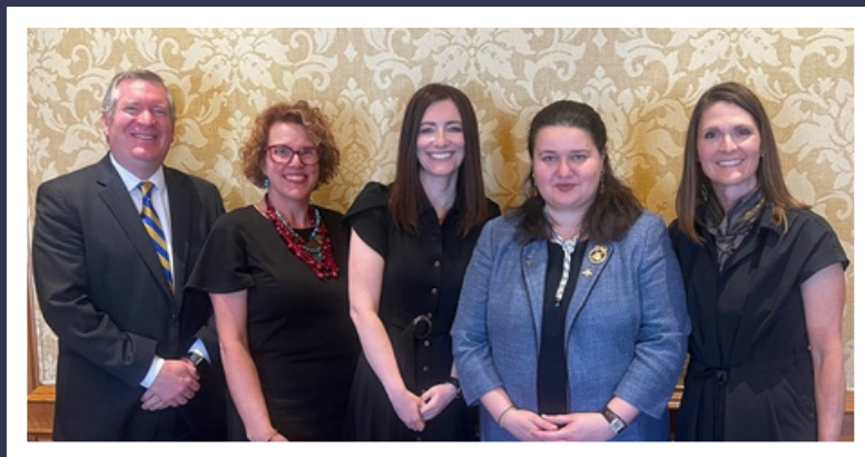
Former Ambassador Oksana Markarova with the To Ukraine With Love team in 2024

~ Volodymyr Zelenskyy President of Ukraine